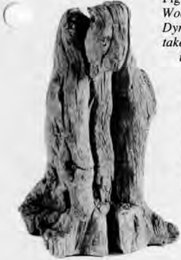
Fig. 2: Wooden Ba bird (OIM 113), Egypt, Dynasty 26-30. This photograph was taken before the object was moved into the climate-controlled organics storage room. The wood shows severe damage as the result of daily and seasonal changes in relative humidity in the storage environ- ment. The warping and cracking are irreversible and have caused the originally painted surface to be completely lost.