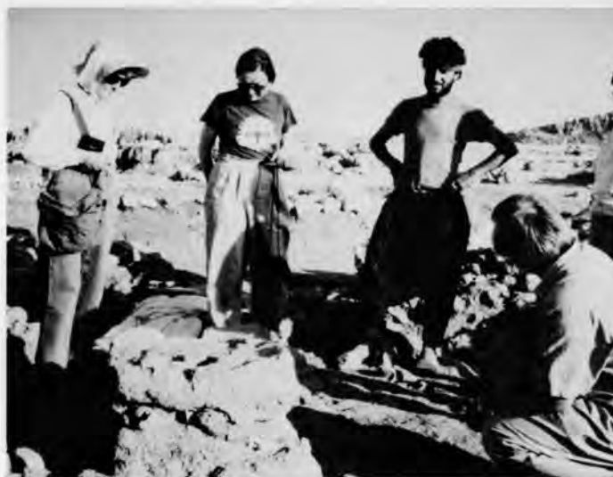
Staff and workmen inspecting the formed, sun-dried mud cover over the burial.