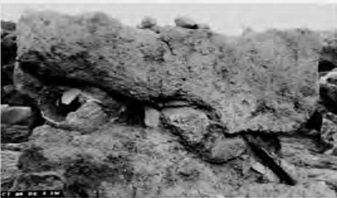
Close-up of the formed sun-dried mud cover over the burial - note skull fragment center left.