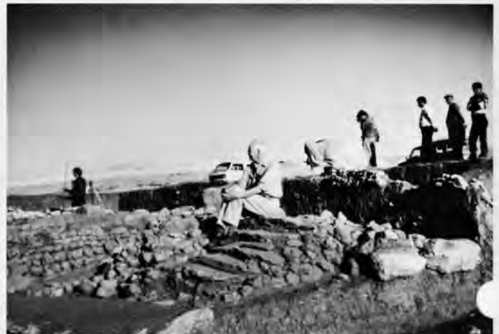
Steps with stone-slab treads, rising up to the level of the tops of the rough stone wall foundations of a house. The walls above the foundations would have been of sun-dried mud brick.

* The recent extension backwards of the recalibration based on tree rings and varves means that the 7000 B C uncalibrated assays we already have for Çayönü really indicate that the village was flourishing around 10,000 years ago.