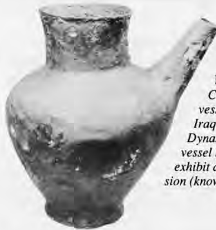
Fig. 3: Copper alloy libation vessel (A 12439), Khafajah, Iraq (Sin Temple IX), Early Dynastic II-III period. This vessel had to be removed from exhibit due to extensive corro- sion (known as "bronze disease").

Meanwhile, we are beginning a series of less radical — and less costly — renovations to make the galleries more attractive, more easily understood by the general public, more informative for the scholar, and more up-to-date in terms of the information they convey. We plan to begin with the Assyrian gallery, which is the most poorly organized and most confusing in terms of its juxtaposition of material from Syria, Anatolia, and Cyprus — as well as Assyria. The renovation will include not only new paint, newly arranged cases, and new labels and other didactic material, but also the exhibition of a few "Assyrian treasures" that have long been buried in the basement of the museum. Ivory inlay panels carved with winged sphinxes, bronze bands decorated with figures in relief, cylinder and stamp seals, royal inscription's, and everyday pottery will all be used to flesh out the picture of Assyrian culture now given solely by the monumental stone reliefs. After a few more weeks' work, we should know whether to aim for opening the rejuvenated gallery in the spring or fall. We will let you know what we decide. . . .