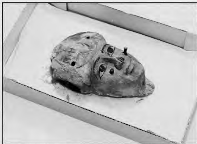
Fig. 1: Wooden coffin fragment (OIM 91), Egypt, Ptolemaic Period. This photograph was taken before the object was moved into the climate-controlled organics storage room. Fragments of the gesso ground and attached paint layer have flaked off the wooden coffin body as it expanded and contracted.