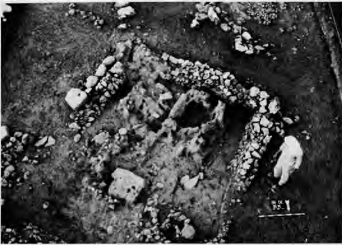
House foundation remains, a sun-dried mud oven-like structure (near upper right center) and (center, lower) a blocky inverted "L" of sun-dried mud, formed to cover a burial.